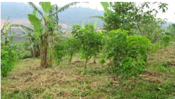
Photo 7 Jatropha planted on a waste dump at the Wassa Mine

As a result of the local stakeholder need for additional land, we revised our rehabilitation plans in consultation with the EPA. Therefore, we started some field trials to guide the rehabilitation work with a view to integrating the rehabilitated land into the economic base for the stakeholder communities. Field trials were completed for vegetables, oil palm Jatropha (fruits are for bio fuel). The results showed that food and cash crops could be produced on the waste dumps. Testing of the produce indicated that the food was of acceptable quality for consumption. Work on the rehabilitation of tailings storage facilities indicated that oil palm could be successfully grown on the tailings. These areas, once rehabilitated to oil palm, will be incorporated in to the GSOPP plantation base, so further providing a secure future for some GSR stakeholders.