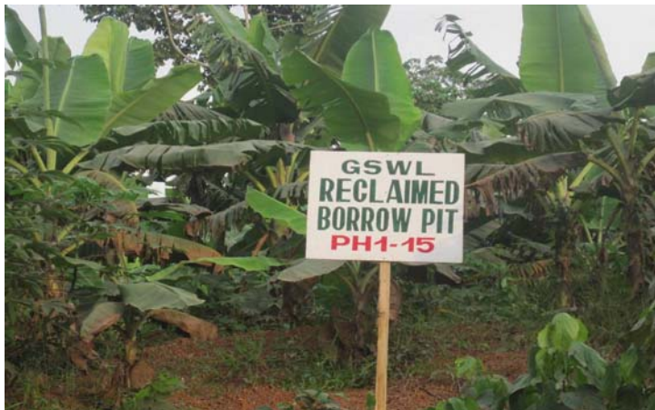
Photo 11 GSWL rehabilitated borrow pit showing plantain

To develop the Hwini Butre and Benso mines for the Wassa operation, and access road was required. The access road was partially new road and partially an upgrade to an existing rural road. However, the