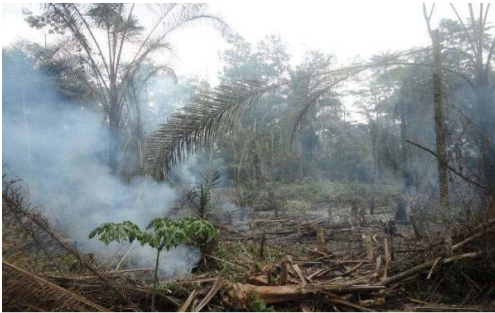
Photo 6 Burning of mine land by stakeholders for farm development

As indicated above, the end land use plan for many of the areas was for tropical forest development. However, pressure on the land base in the area resulted in some of the rehabilitated areas being burned by farmers so that the land can be used for farming. This is the normal approach by subsistence farmers who