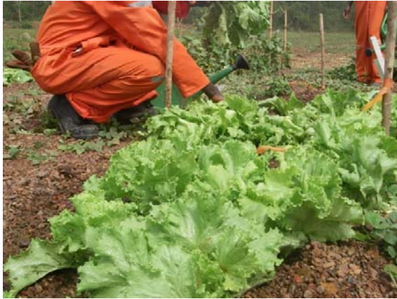
Photo 9 Lettuce at a Wassa waste dump