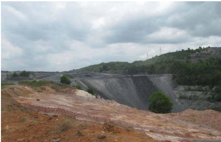
Photo 12 Backfilling the GSBPL Plant North Pit

The Plant North Pit was mined adjacent to the town of Prestea. Prestea was developed as a result of the underground mines in the area that have been operating throughout the past 120 years. The environmental approval for the development of the project required that the pit be backfilled and then rehabilitated. Due to