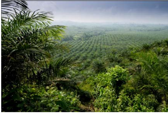
Photo 2 Bogoso Oil Palm Plantation