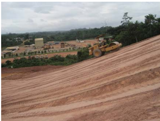
Photo 4 Capping for ARD prevention at Subriso East Waste Dump

A typical rehabilitation sequence for a potentially acid generating dump is shown in the following photographs. The waste is capped with 2 m of compacted oxide and the planted to a mix of legumes and grasses to prevent erosion and provide stability to the waste dump cap.