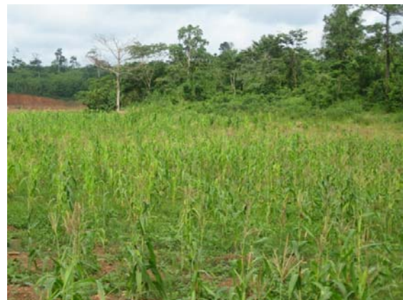
Photo 8 Maize planted at a Wassa Waste Dump