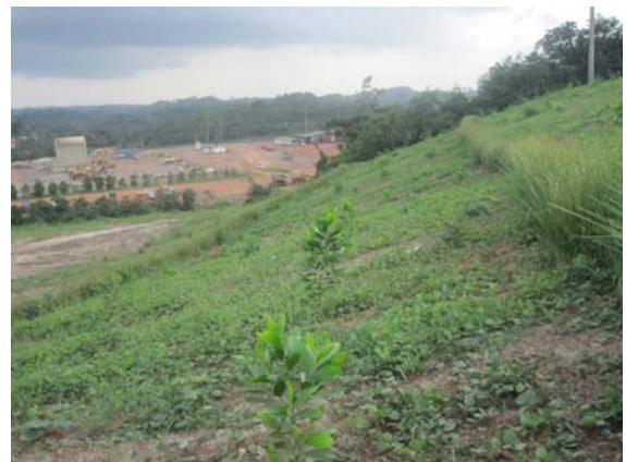
Photo 5 Initial plant at Subriso East Waste Dump