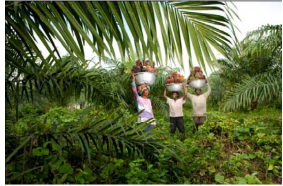
Photo 3 Transporting the fresh fruit bunches to the road for collection