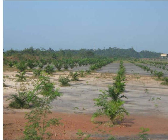
Photo 10 Direct planting of oil palm in a closed out tailings storage facility

The trials indicated that the rehabilitated sites could be incorporated into the local agricultural land base; the maize produced was donated to a local school as part of the Ghana School Feeding Program. Therefore, the rehabilitation planning process was adapted to incorporate a wider stakeholder consultation in that community stakeholder consultation was added and the suggestions incorporated into the rehabilitation and closure plan before it was forwarded to the EPA for final approval. Community consultation for rehabilitation and closure is key to the success of plans where operations are close, or easily accessible, to stakeholder communities.